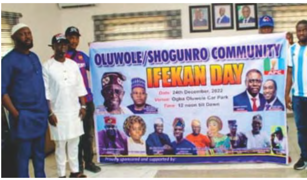
Communities celebrating peaceful coexistence

He appealed to all residents of Ojodu to maintain mutual understanding among "worthy ambassador of one another for a conducive living