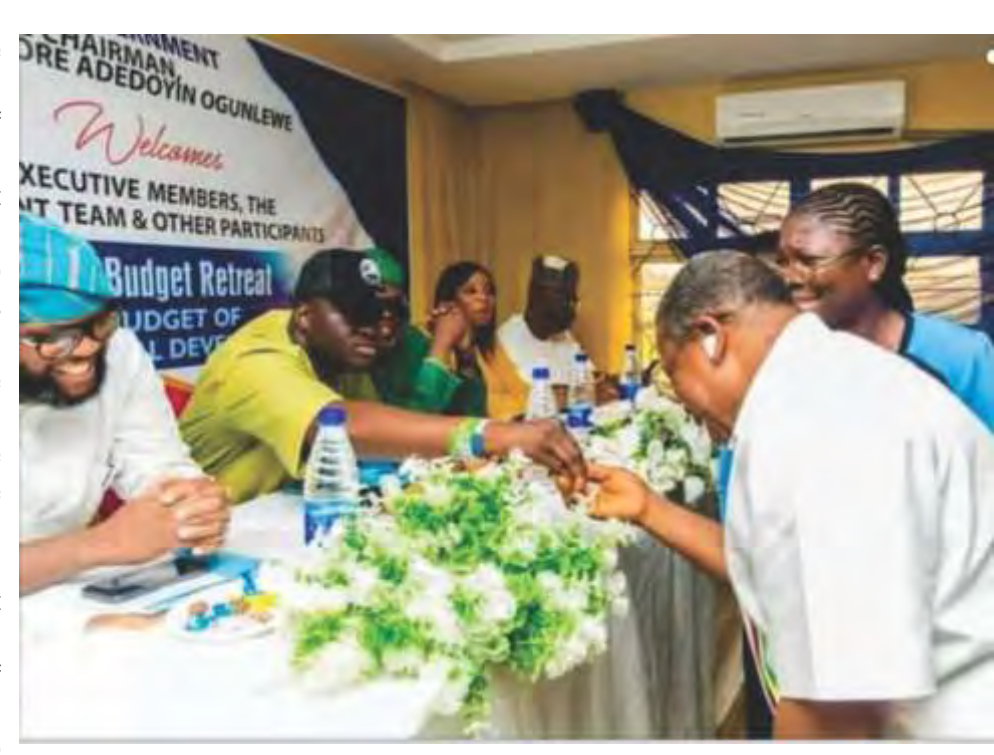
Kosofe budget retreat

He, therefore, sought more commitment and d e d i c a t i o n o f m a n a g e m e n t a n d executive members to do for Kosofe people.