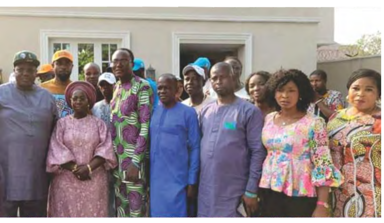
relatives without Adebule admits APC Youth elders in Ojo